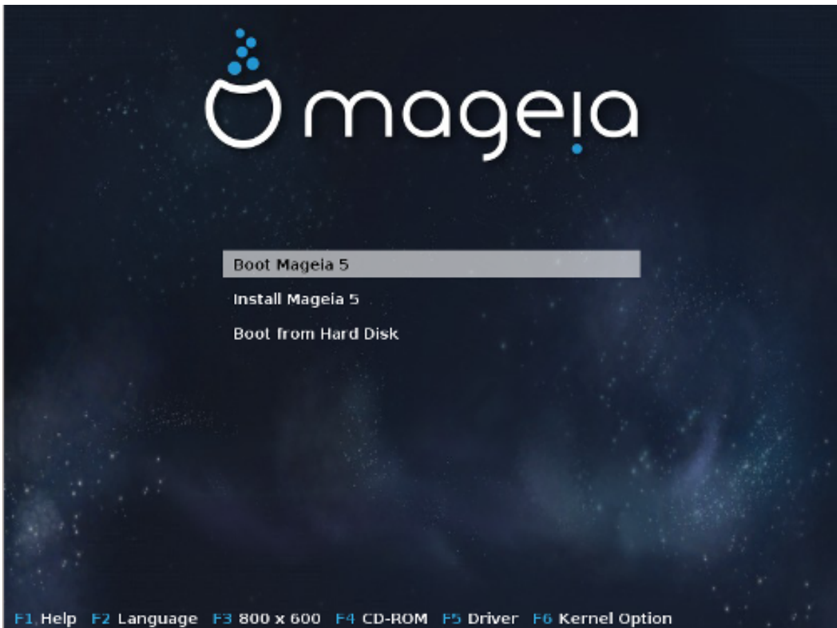
First screen while booting in BIOS mode

In the middle menu, you have the choice between three actions: